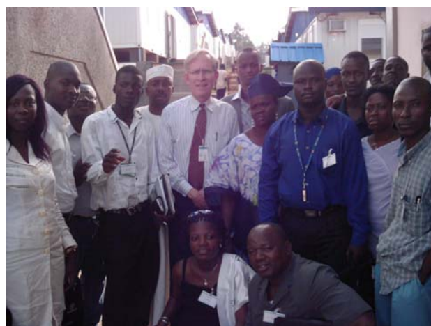
West Africa Youth Parliamentary Forum delegates with Dr. David Crane of the United Nations Special Court in Sierra Leone